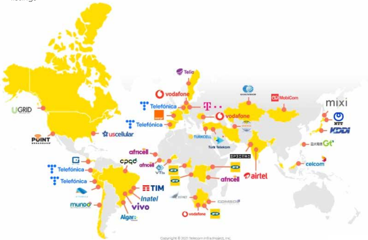
Figure 2: OOPT deployment map, 2022