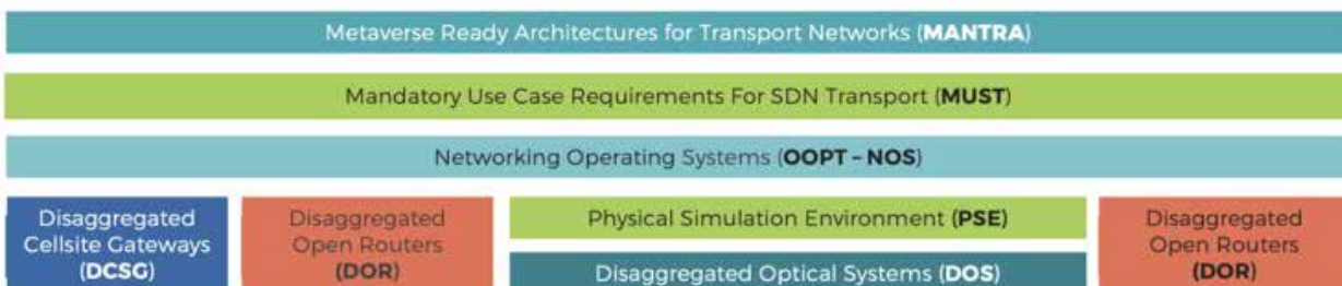
Figure 1: OOPT Project Group Structure

Marí Moretón said, "We now have 10+ sub groups running different tracks and we are very proud of this journey. We have more than 50 commercial deployments that we have incubated over the years, across multiple operators, and 100,000 devices that we have deployed in networks around the world. We couldn't have achieved that without the community we have built."